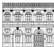
PALAZZO CORBETTA BELLINI DI LESSOLO