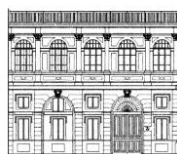
PALAZZO CORBETTA BELLINI DI LESSOLO